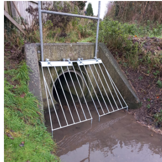
New Grill installed at culvert head on Harthill Ave.