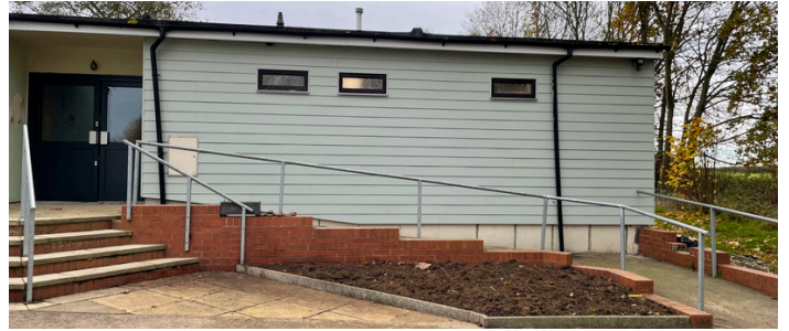
New Village Hall Main entrance