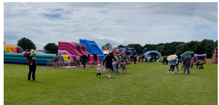
Family Fun at Bouncyfest 2024

Coffee Morning every Wednesday 10:30-11:30am