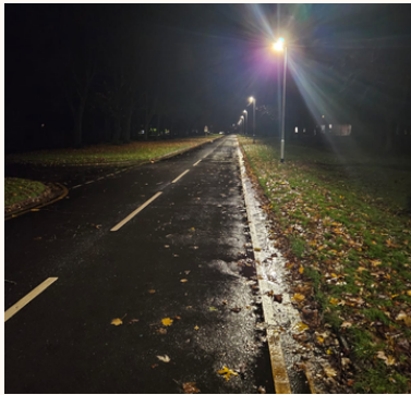
Street Lights back on in Grange Road