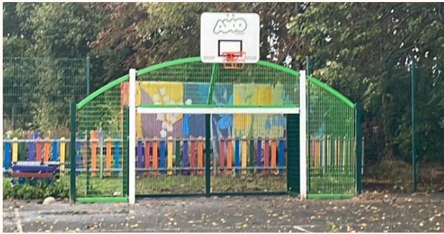
New practice football goal